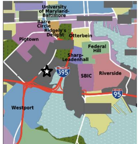
Location of casino shown with a star.